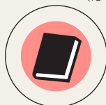
SKETCHBOOK (no larger than 8.5x11")

T-SHIRT/ARTICLE OF CLOTHING (to silk screen on, must be blank)