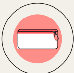
POUCH (to hold supplies)