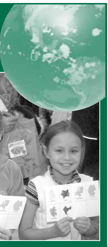
s a passport to get stamped at

will now be competing with ich will be launched in 2007.