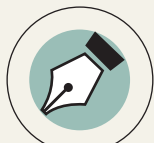
ADOBE CREATIVE SUITE* (CC 2021)