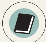
SKETCHBOOK (no larger than 8.5x11")