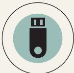
ADOBE CREATIVE SUITE* (CC 2021)