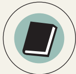
SKETCHBOOK (no larger than 8.5x11")