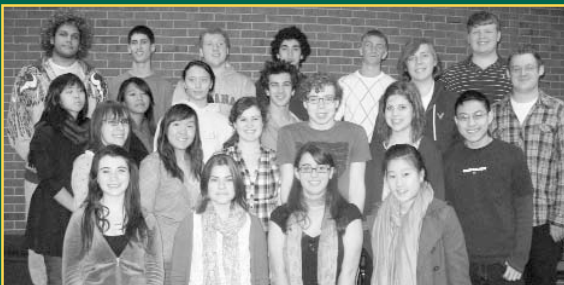
Pictured are many of the Ward Melville High School student-musicians selected to perform during the upcoming NYSCAME-SCMEA All-County and NYSSMA All-State Music Festivals.

The students qualified for participation in the ensembles based on their scores in last spring’s NYSSMA solo and ensemble festivals.