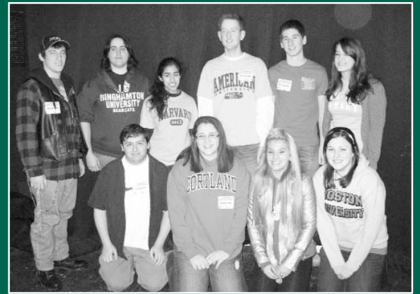
More than 60 Ward Melville High School Class of 2009 alumni returned to their alma mater in January to participate in the school's annual Alumni Day.

In addition to these two January programs, this year the guidance department once again partnered with several college campuses to offer an on-site Admissions Program for members of the Class of 2010. During the event, college admissions staff visited with seniors to conduct personal interviews, evaluate their applications, and ultimately render a decision for acceptance.