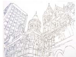
Example of architectural composition.