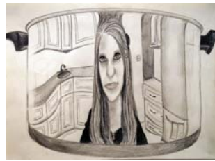
Reflection in a pot.