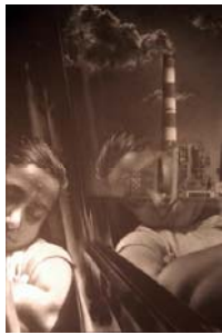
Reflection in a window.