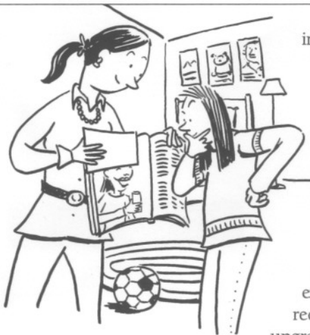
image the company is portraying (example "Good-looking and popular people drink our soda").

Activity: Cover up brand names in ads. See if your middle grader can guess what they're selling. She may be surprised by how much they focus on attractive models or funny situations rather than on the products. Ask her what